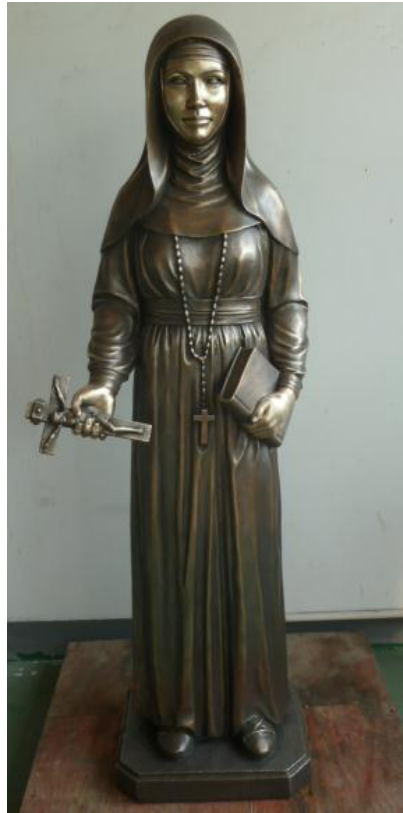
Saint Mary MacKillop