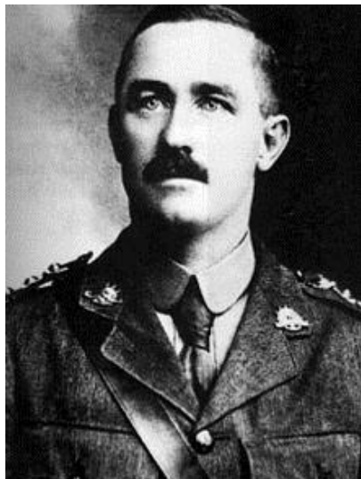
Lieutenant (later Major) Frederick Tubb VC

Everlon Bronze has been commissioned to sculpt the Three Life Sized Bronze Statues of the following Victorian Cross recipients for the Euroa Honouring our Hero's Committee: