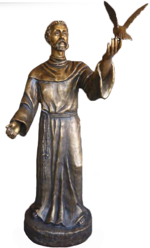
Saint Francis of Assisi