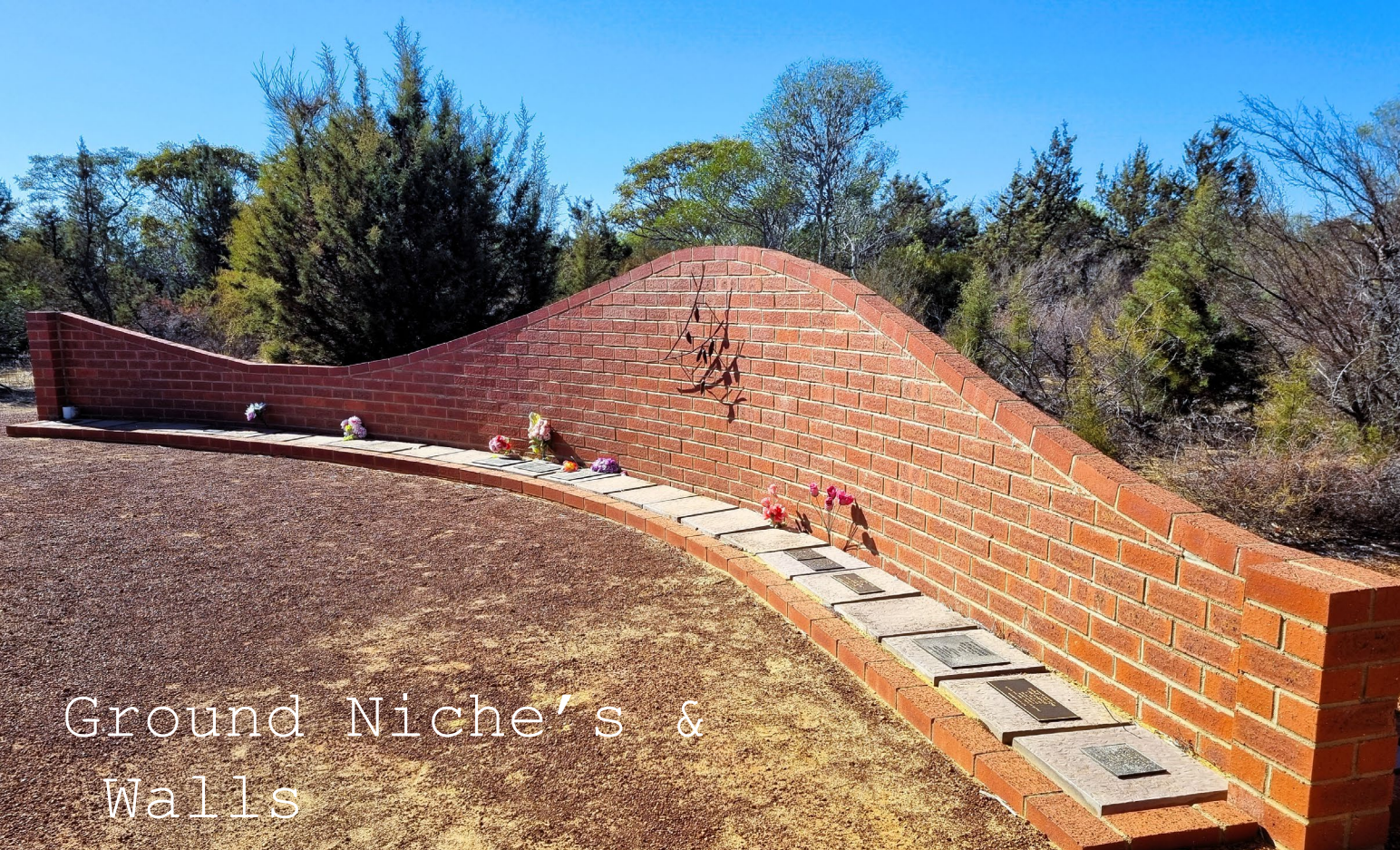
Ground Niche's & Walls